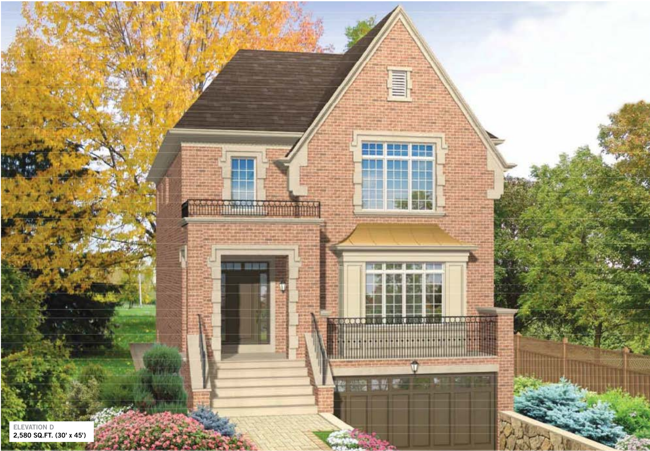
ELEVATION D 2,580 SQ.FT. (30' x 45')