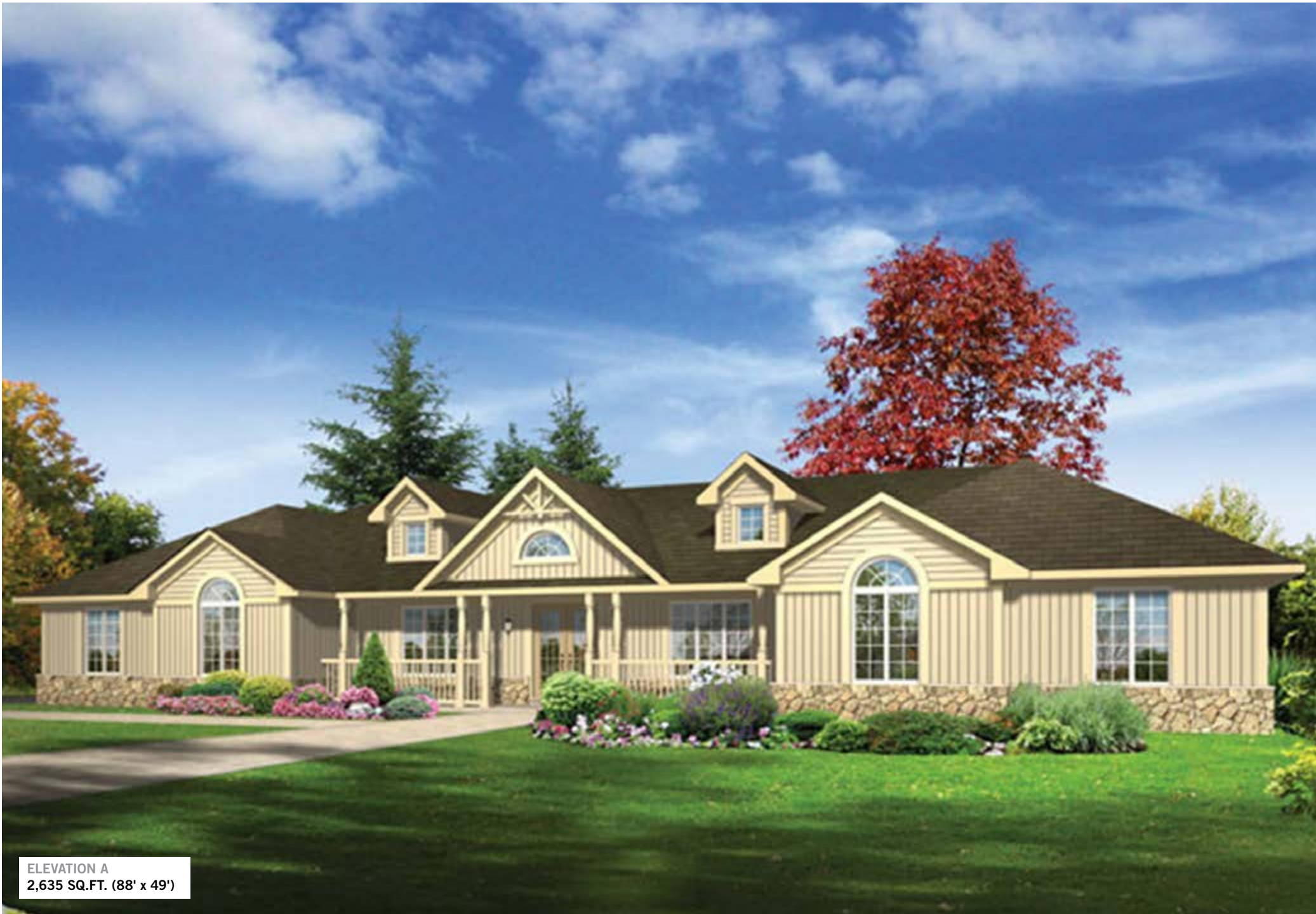
ELEVATION A 2,635 SQ.FT. (88' x 49')